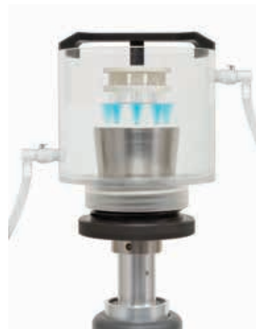
Part # 431C2 Inner Diameter of Cup: 5.5" Diameter of Horn: 2.5" Tube Rack #440 (8 Tubes) is Included